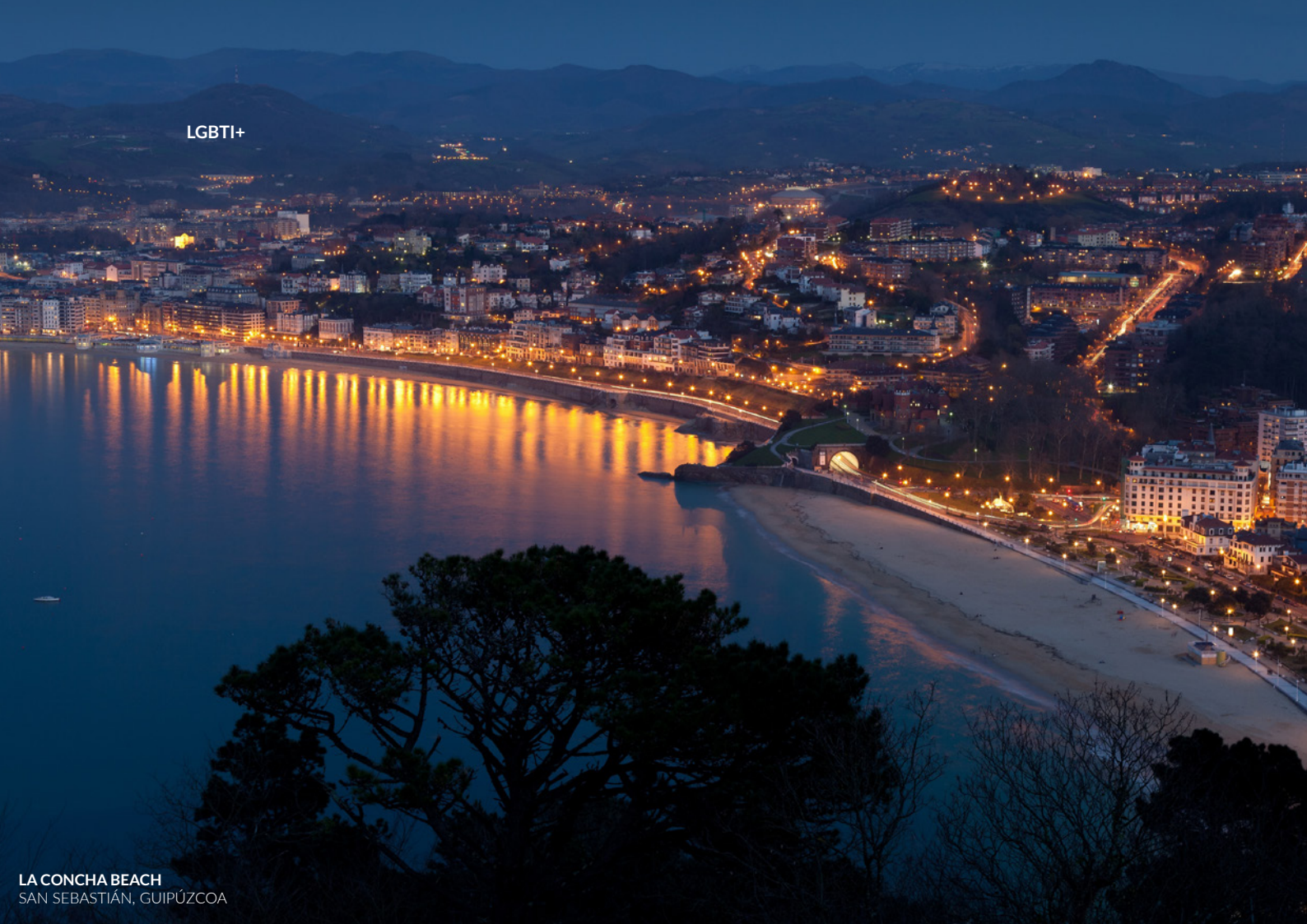
LA CONCHA BEACH SAN SEBASTIÁN, GUIPÚZCOA