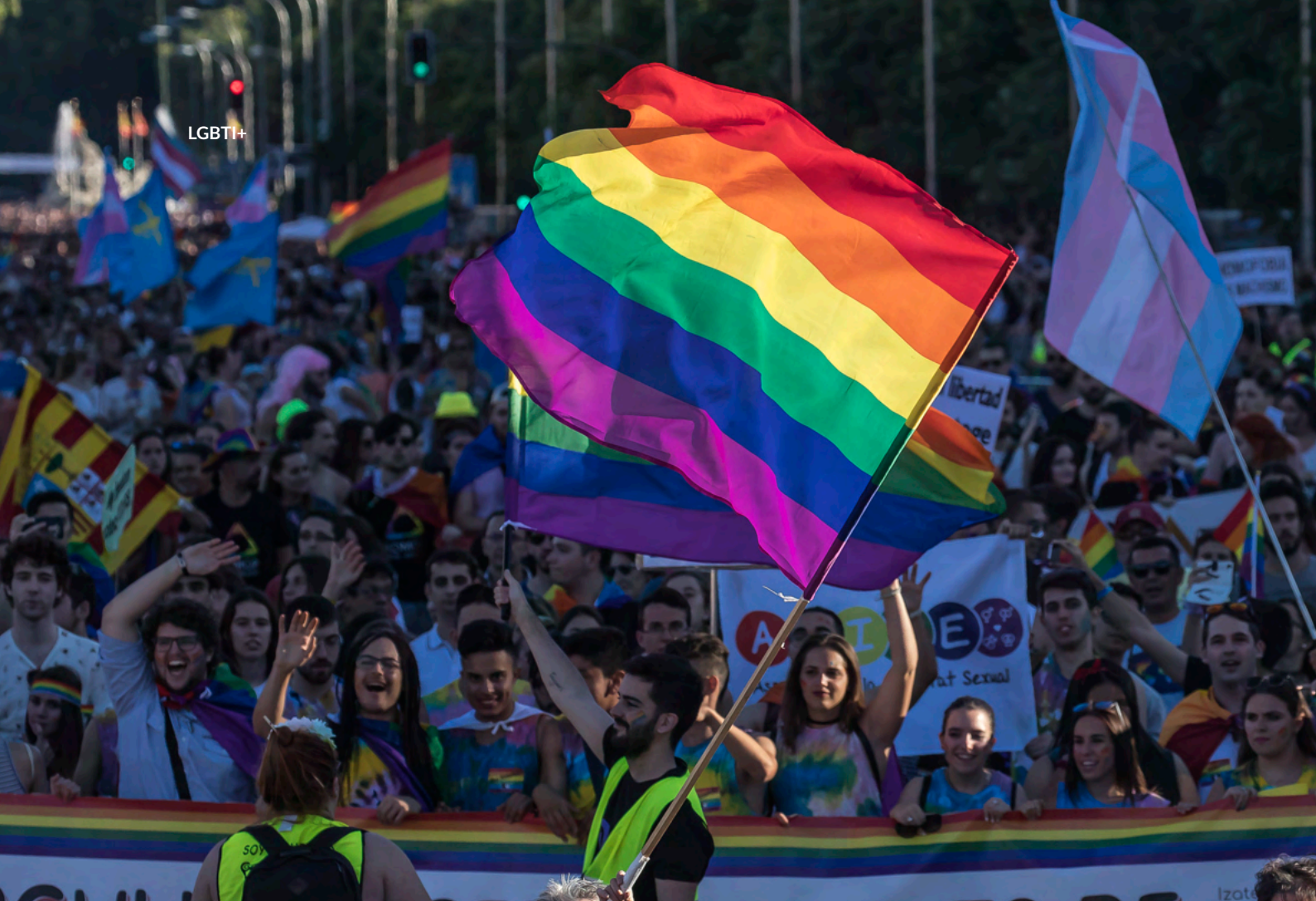
▲ GAY PRIDE MARCH NEAR THE PUERTA DE ALCALÁ MADRID