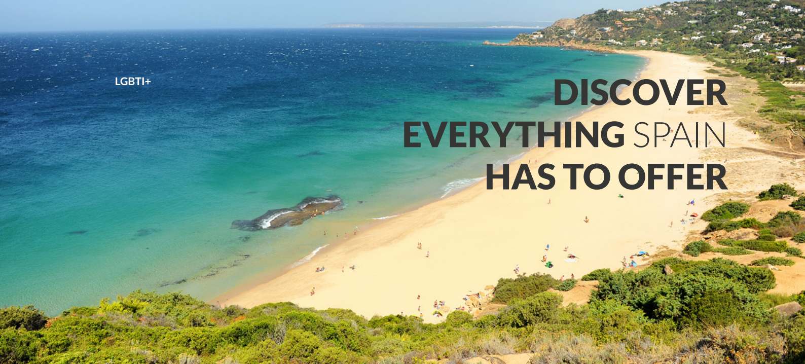
▲ PLAYA DE LOS ALEMANES ZAHARA DE LOS ATUNES, CÁDIZ

Enjoy the sea, the sand and the sun. Try any of the numerous specialities in Spain's delicious cuisine and explore its historical heritage. Or you can switch off and relax in a wide range of different natural environments and enjoy our privileged climate. You can do all this and much more in Spain.