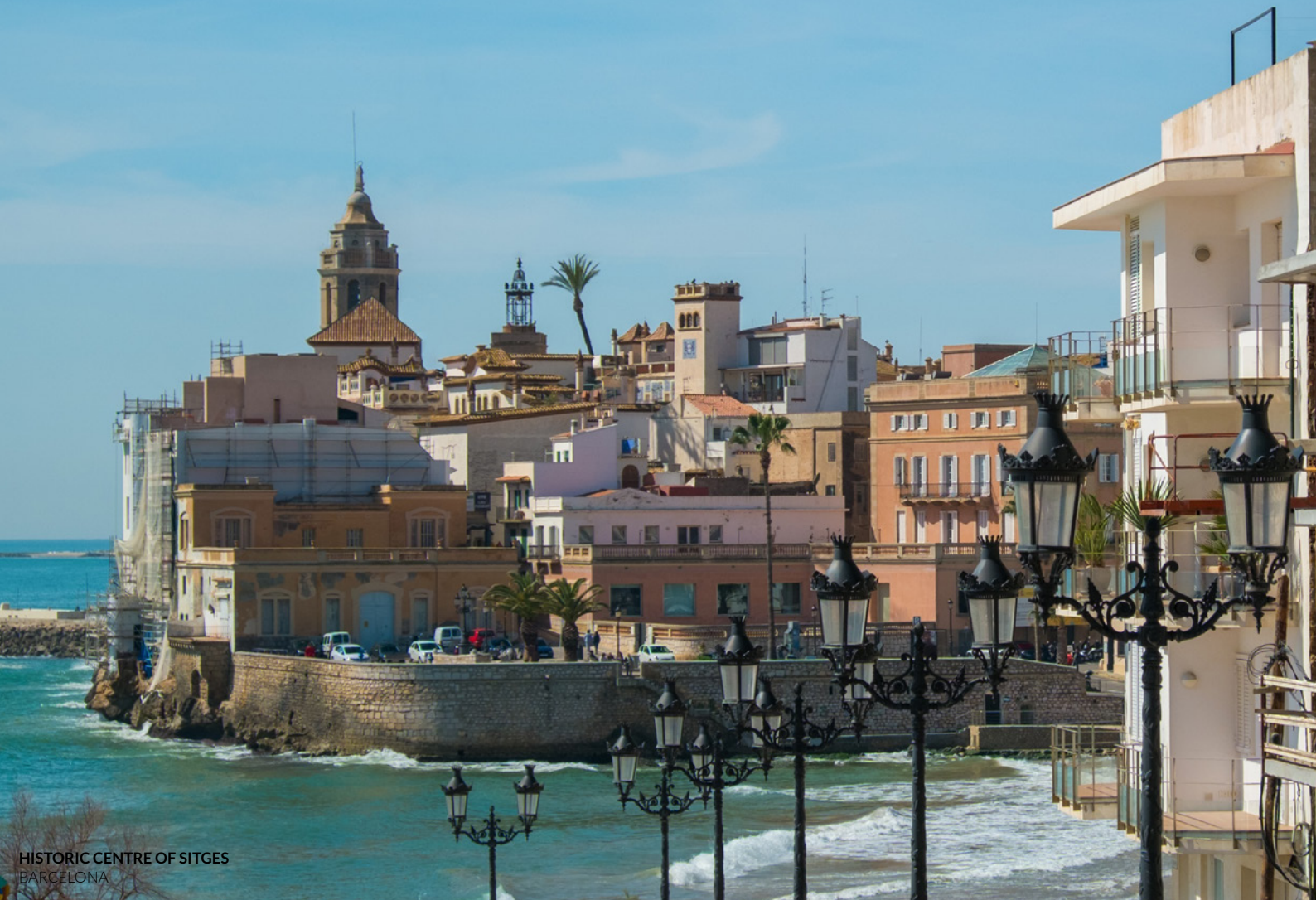
HISTORIC CENTRE OF SITGES BARCELONA