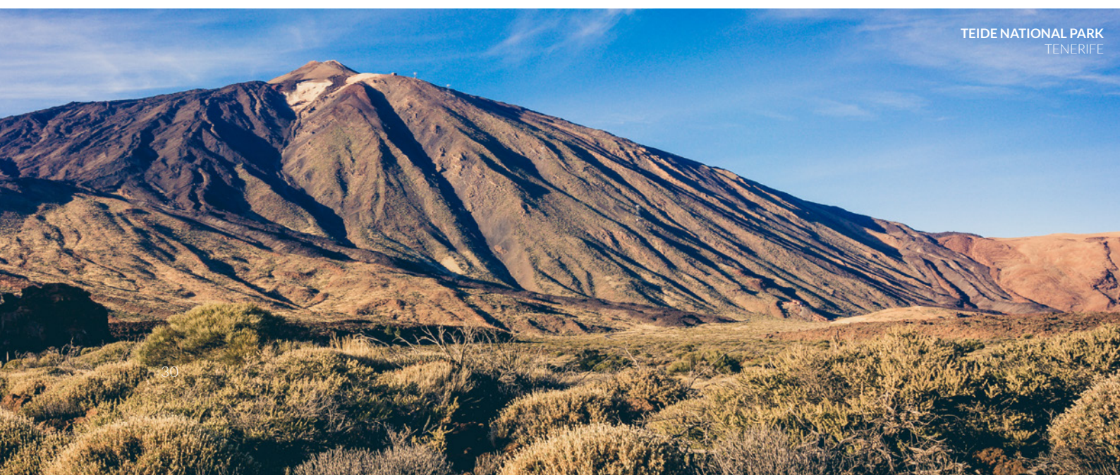
TEIDE NATIONAL PARK TENERIFE

The best place for shopping in Gran Canaria is the tourist area in the south of the island or the capital. Some of the best shops can be found in the historic Calle de Triana and the surrounding area. In Tenerife you'll find many places to choose from in Puerto de la Cruz , Santa Cruz and San Cristóbal de La Laguna .