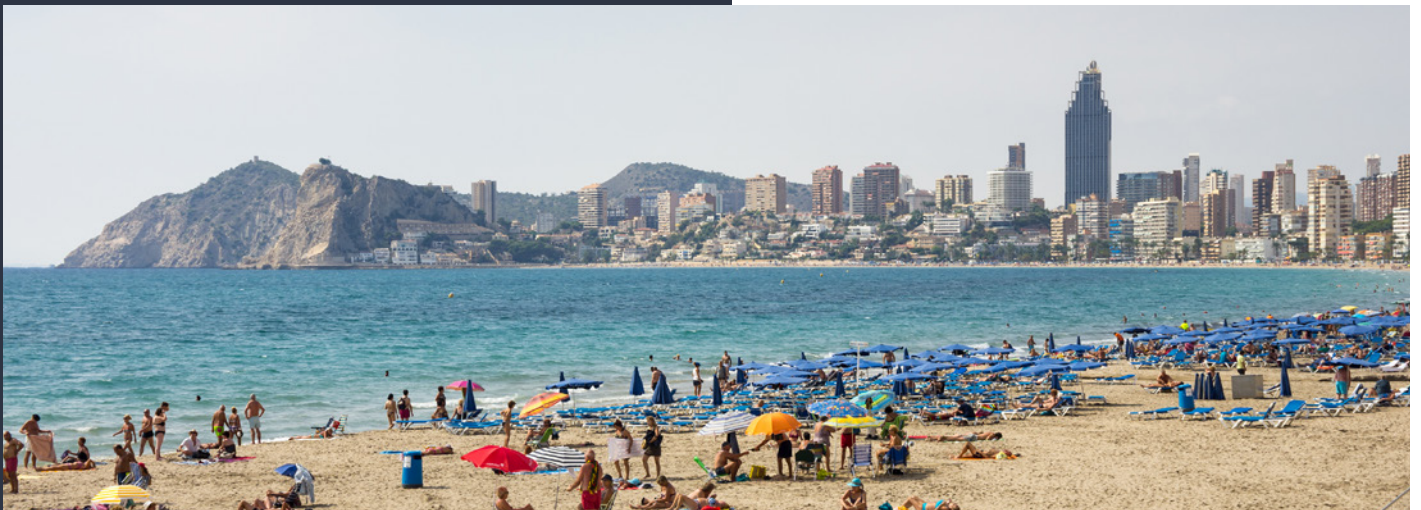
▲ LEVANTE BEACH ALICANTE

At nightfall you'll be dazzled by the bright neon lights. In Benidorm you'll find LGBTI+ bars and pubs to suit every taste. You can take in shows and performances with the top drag queens of the moment, or dance till dawn at one of the beachfront fiestas.