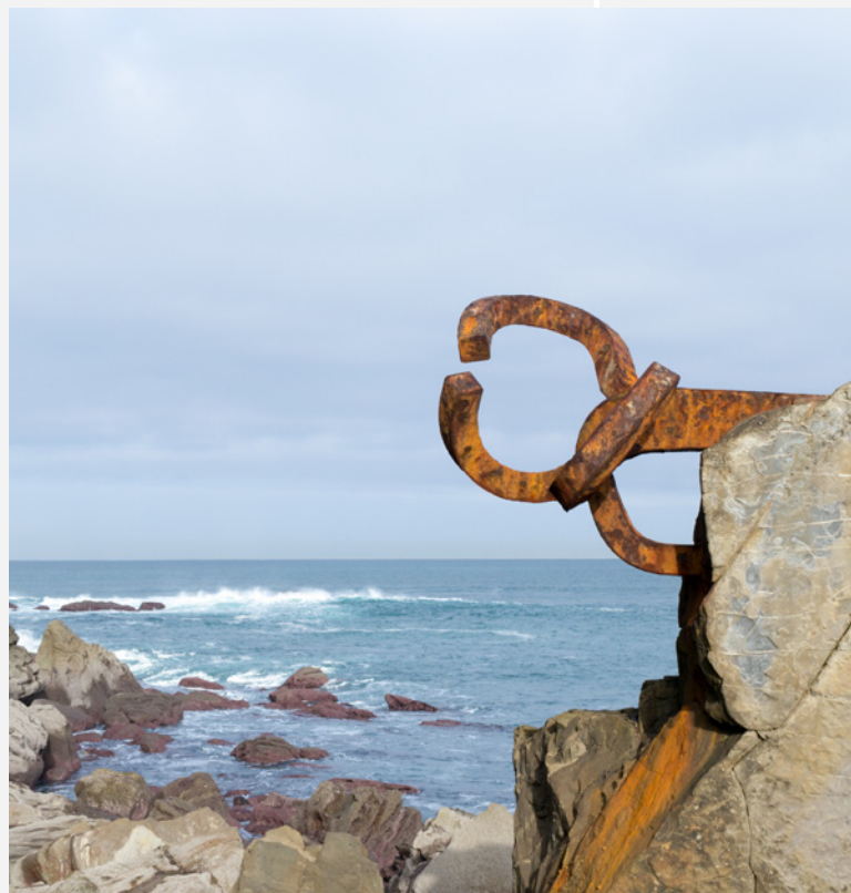
▲ EL PEINE DEL VIENTO SCULPTURE SAN SEBASTIÁN, GUIPÚZCOA