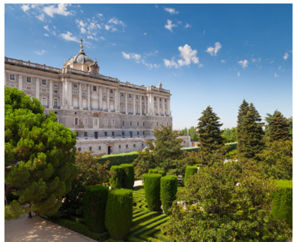
▲ ROYAL PALACE MADRID