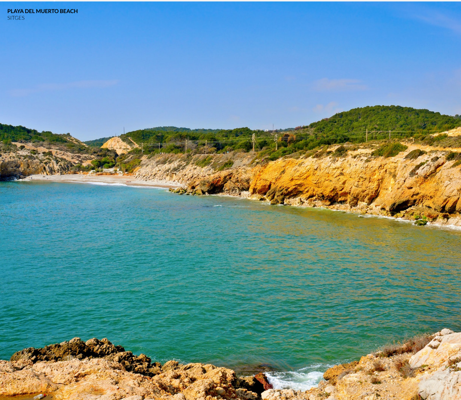
PLAYA DEL MUERTO BEACH SITGES

If you're going to Barcelona, save a few days to enjoy Sitges. With picturesque streets and beaches, and a wide range of attractions for the LGBTI+ community this is the perfect place to visit in combination with the Catalan capital. This small coastal town is home to numerous museums, restaurants, clubs, shops, and long promenades. Come and see for yourself!