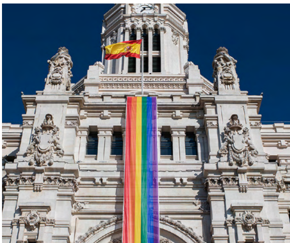
▲ MADRID CITY HALL

Come and discover the capital of Spain, and you'll see for yourself how the essence of diversity can be found in every corner of the city. How about discovering a neighbourhood that was created with you in mind? Then come to Chueca!