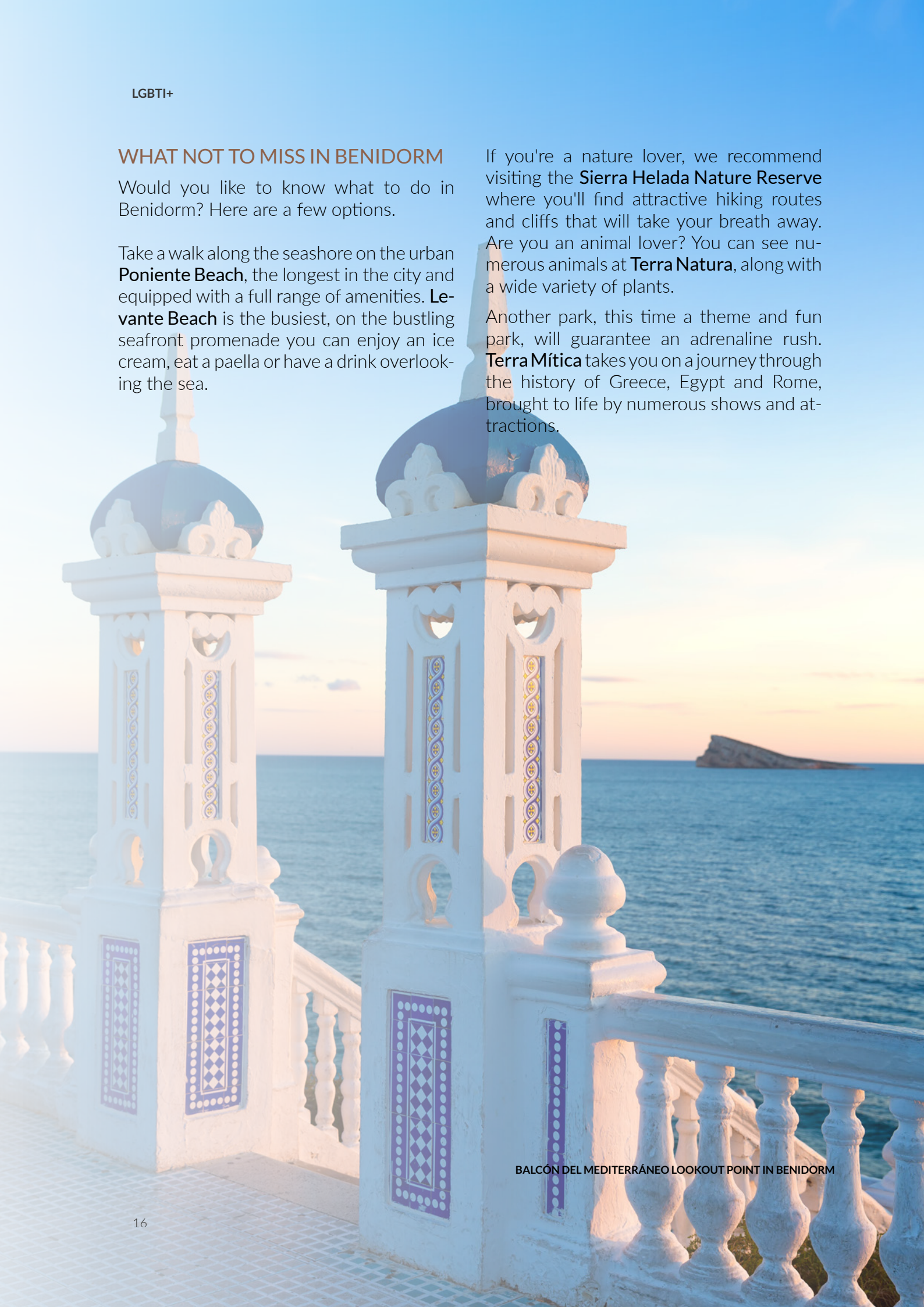
BALCÓN DEL MEDITERRÁNEO LOOKOUT POINT IN BENIDORM

Another park, this time a theme and fun park, will guarantee an adrenaline rush. Terra Mítica takes you on a journey through the history of Greece, Egypt and Rome, brought to life by numerous shows and attractions.