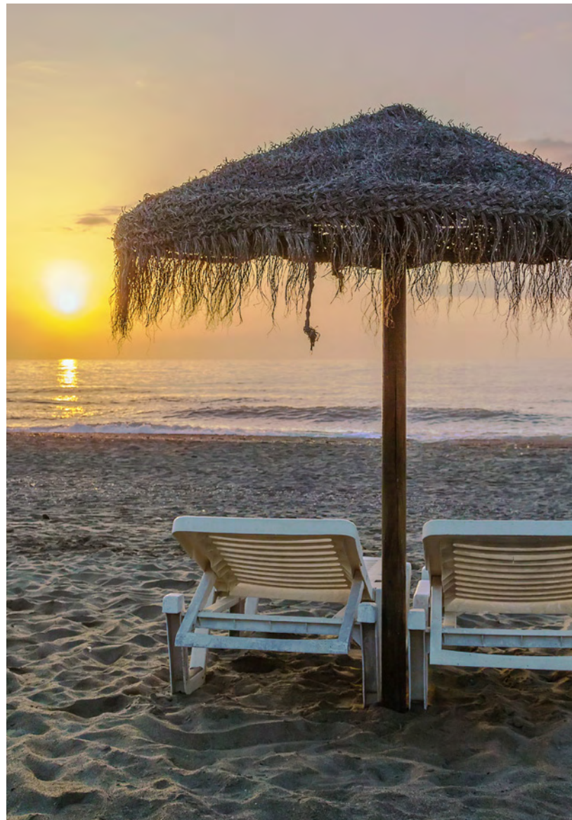
▲ TORREMOLINOS BEACH MÁLAGA

When you tire of the hustle and bustle of the seafront promenade, you can relax away from the busy tourist areas in the El Calvario district , it's one of the most traditional neighbourhoods in Torremolinos. This is a great place to have a drink and mingle with the locals in any of the typical bars. Highlights include the Plaza Blas Infante and the Fuente de los Manantiales fountain.