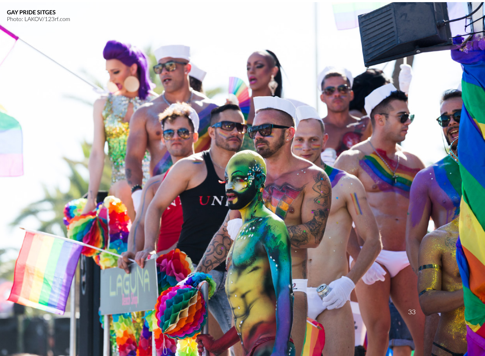
GAY PRIDE SITGES

Are you up to two weeks of partying? Come to Barcelona in August and join in with this massively attended festival. You can take part in its famous pool parties , dance to the sound of the music from the latest DJs and have a great time at the party at the Illa Fantasia waterpark . The festival includes cultural and sports activities and talks on the subject of LGBTI+.